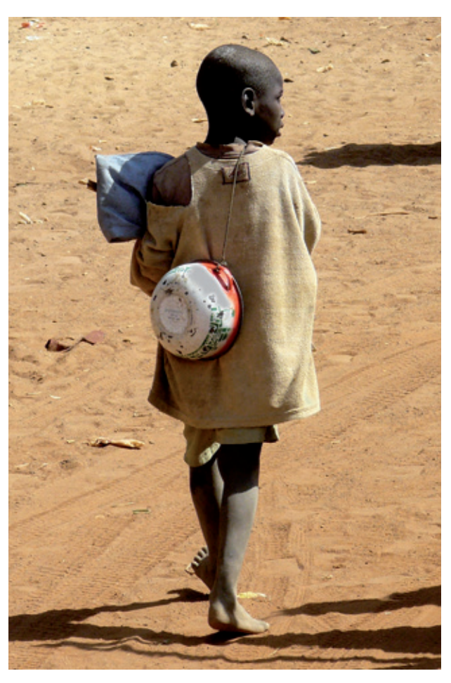
Figure 5. Kitgum, Uganda.

Freeing a blind person from the cataract that progressively blurs vision until none is left, also means freeing a great number of children who are used to guide blind elderly people, sacrificing their adolescence and their education. Over the years, through the "Ridare la Luce" program implemented and supported by the Italian Air Force, Alenia Aeronautica and AFMAL, hundreds of surgical procedures have been performed to restore the vision not only of adults but also of many children who,