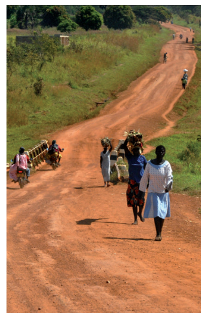
Figure 3. Kitgum, Uganda.