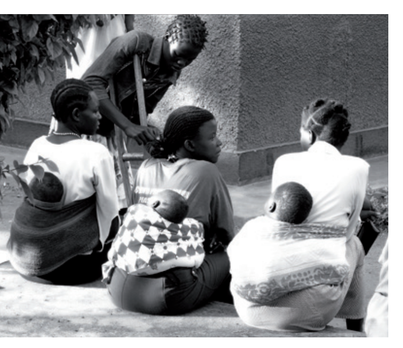
Figure 4. Kitgum, Uganda.

The women work very hard, they cook, go get water however far it may be, harvest and grind wheat to make bread, and watch the children, however numerous. They walk miles and miles, slowly, carrying incredible weights on their heads: extremely heavy containers, clothes still dripping with water from the river, stacks of firewood. You see them often, in groups, on the bank of the river along which, over time, a small cluster of mud and straw dwellings has developed: it's a gathering place, perhaps the only one, where they can socialize, take their children to play when the school is too far away and the kindergarten is right there, along those few yards of riverside where the Niger flows more slowly.