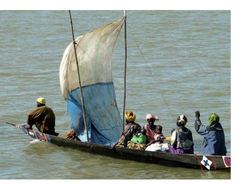
Figure 2. Niger, Mopti, Mali.

In clashing contrast with this scenery, the Niger river flows unperturbed, without realizing that without its water, all around it there would not even be the little that there is. Evening after evening, at sunset, it quietly goes to sleep (Figures 1-2).